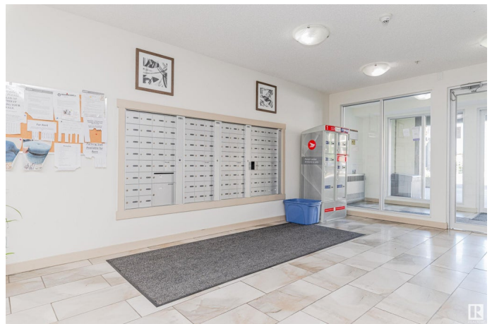
223-5816 Mullen Pl NW, Edmonton, AB