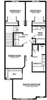
2ND FLOOR 1,097 SQ.FT (8 FT. CEILINGS)