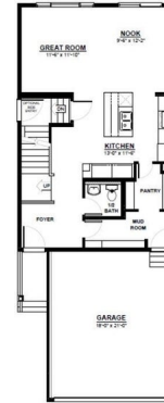
MAIN FLOOR 759 SQ.FT (9 FT. CEILINGS)

2 Storey 2nd Floor Laundry Quartz Countertops Throughout Walk Through pantry & Mudroom Massive Chefs Kitchen with Built in Oven & Microwave Second Floor Bonus Room Oversized Master Bedroom 5 Piece Ensuite Large Master Walk-in Closet